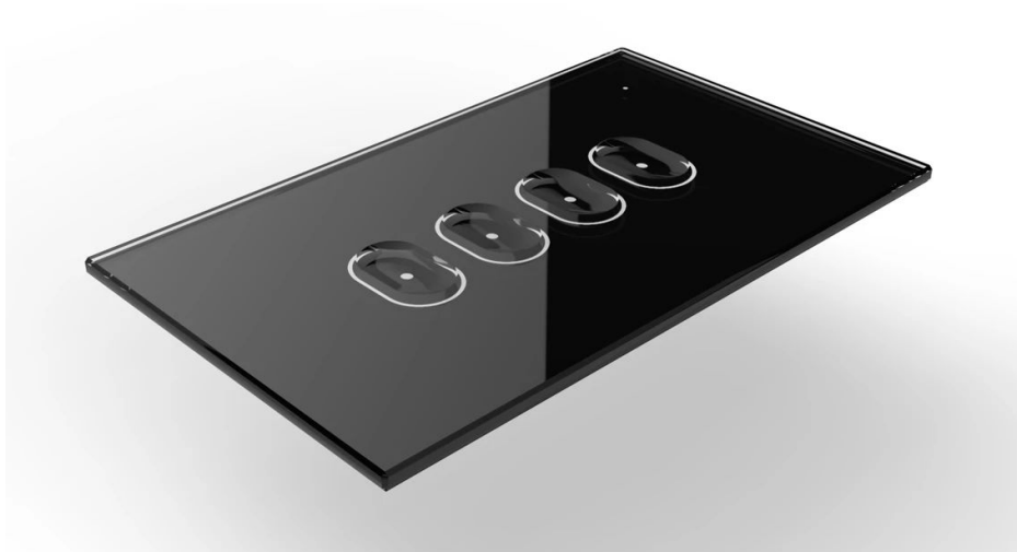
Figure 1. LIFX Switch goes on pre-sale today for consumer and direct purchase customers

As LIFX Switch units roll off the production line, the first units will go to trade and commercial customers for whom sales have already commenced. Consumer and direct purchase customers now have the opportunity to reserve their LIFX Switches with the launch of this pre-sale, and deliveries are expected to commence in the mid-late January 2020 timeframe. Today's launch will enable customers to bundle their LIFX Switches with Black Friday promotions and bundles being offered on the LIFX online web store.