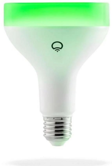
Figure 3. LIFX's BR30 and BR30+ range is now IP65 rated and certified to operate down to -30°C.

are now guaranteed for operation down to -30°C (both the light and the smart functionality), as each successfully completed a range of 'cold start' tests (ie: each light still turns on successfully) down to -40°C.